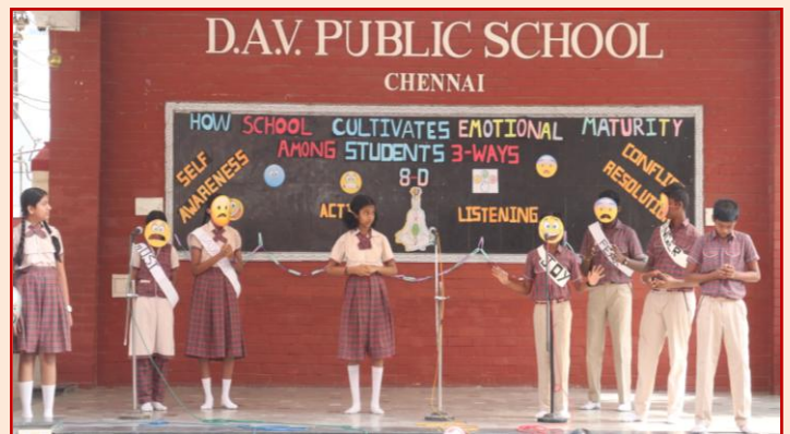
Inside Out at DAV – An Emotional Skit