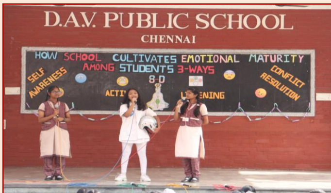
Sunita Williams, a role played by the Student, is visiting the Class VIII-D Assembly of DAVPS