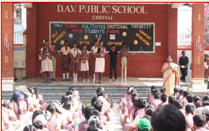
Principal Madam Sharing her Valuable Feedback on the Class Assembly