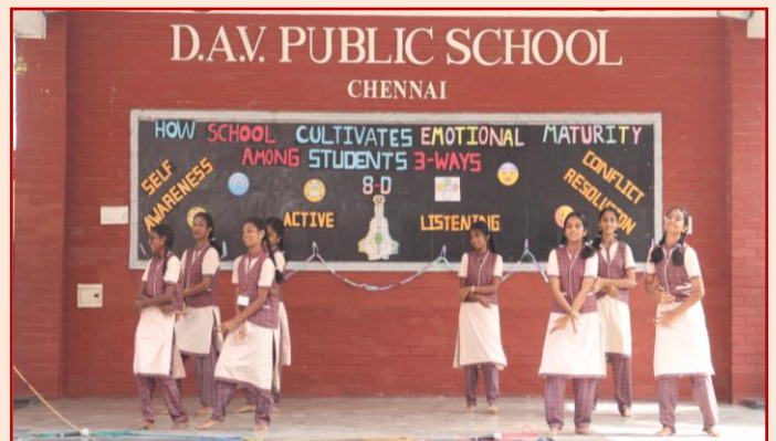
Dance Enthusiasts Dancing for the Tune