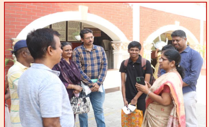
Parents Appreciate the School's Initiatives in the Holistic Development of the Students