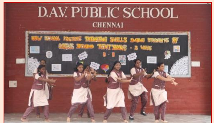
Fusion Fest - Dance