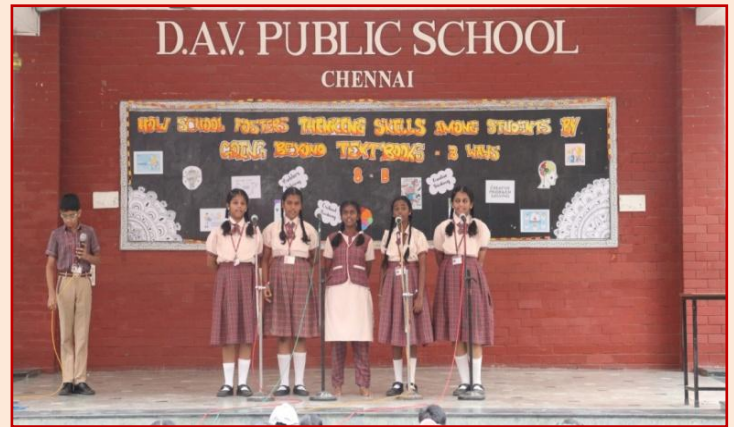
Musical Reflection – The Power of Inquiry (Song)