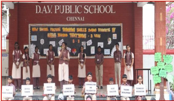
Unveiling the Approach – How D.A.V. Fosters Thinking Skills