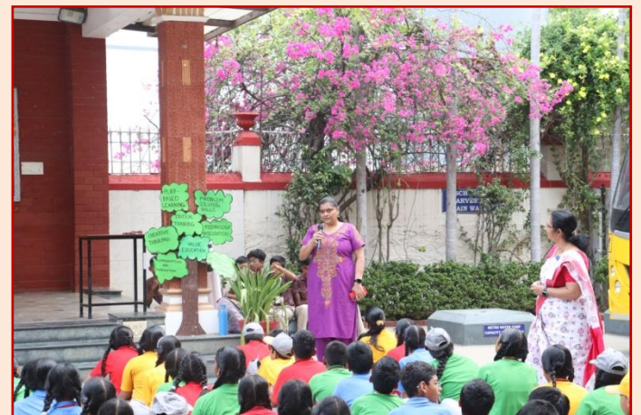
Positive Perspective by Parent