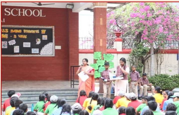
Constructive Critique by Principal ma'am