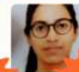
Sunny selected at NEET