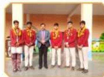
Merit Scorers of Akash