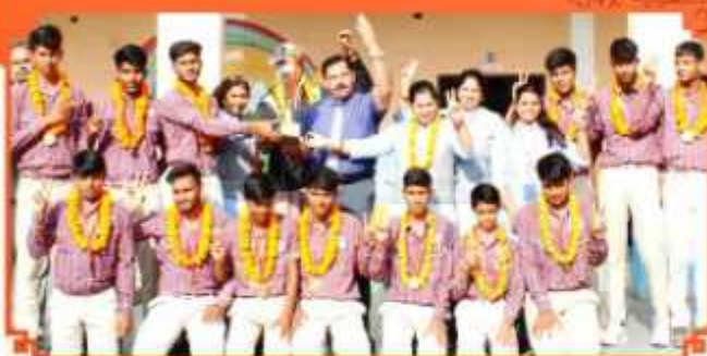
Kabaddi team winner in DAV National Sports Zonal Tournament 2022-23