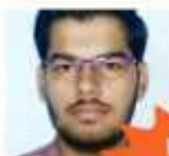
Harsh selected at NEET